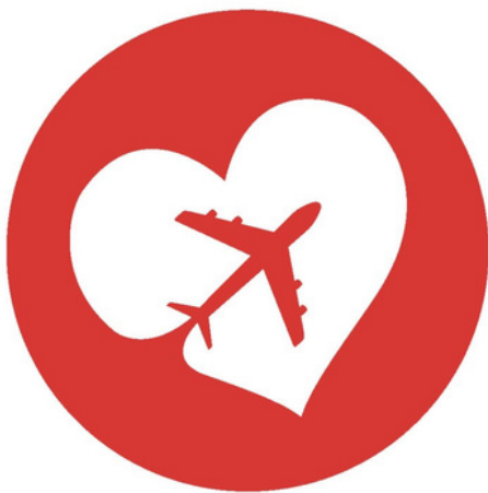
Give a mile